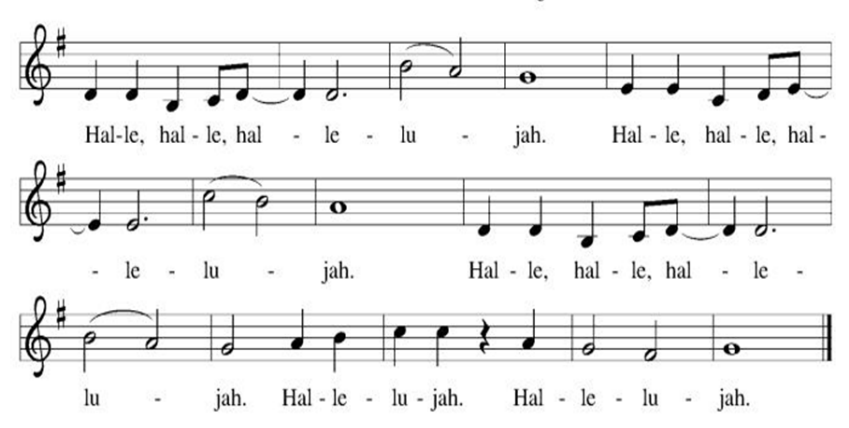
GOSPEL ACCLAMATION - WOV (BLUE) - 612 Halle, Halle, Hallelujah